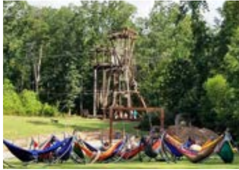
Know Boundaries Challenge Course and Hammock Hangout