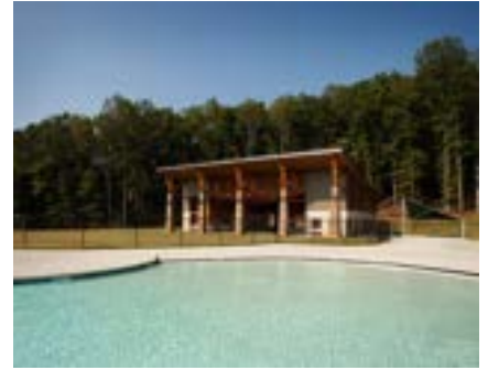
Zero depth entry pool & Fireside hall