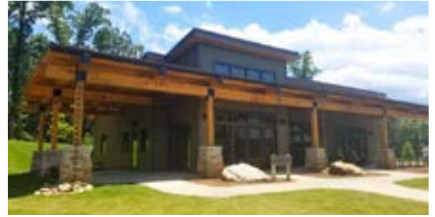
Camper Care Center

Our Healthcare Team consists of an RN or Paramedic who is on site 24 hours/day and four Medications Technicians who receive, inventory, and administer all camper medications. Additionally, all Camp staff are certified in CPR/First Aid/AED and there are three AED's on site. The RN is the manager of all camper health needs that may arise. The RN will use their professional training and judgment as well as consultation with a camp Administrator to determine if/when parents/caregivers should be notified regarding camper health issues. However, we follow a "when in doubt make the call" practice. We are concerned with the health and safety of all campers and staff. Because of the group nature of living at camp in cabins, and because isolation undermines the purpose of the camp experience, if a camper is deemed to be contagious we will call to arrange for the camper to be picked up. This, of course, is never our desire, but maintaining the health of all is vital.