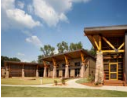
B Pod Cabins

Camp Spearhead began in 1968 at Paris Mountain State Park, but our current home is located within Pleasant Ridge County Park, just off Hwy 11, in Marietta, SC. The facility was built with campers in the forefront, creating a space where campers can move safely and easily throughout our site. For GPS directions, please use 4232 Hwy 11, Marietta, SC 29661 , instead of “Camp Spearhead” to ensure you arrive at the correct location.